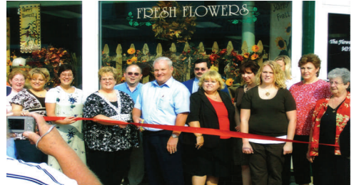
The Flower Bin Etc. Chamber's Ribbon Cutting Ceremony August 6, 2007

Please stop in and meet your new neighbor and take the time to smell the roses while you are in there.