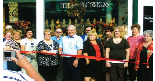
The Flower Bin Etc. Chamber's Ribbon Cutting Ceremony August 6, 2007

Please stop in and meet your new neighbor and take the time to smell the roses while you are in there.